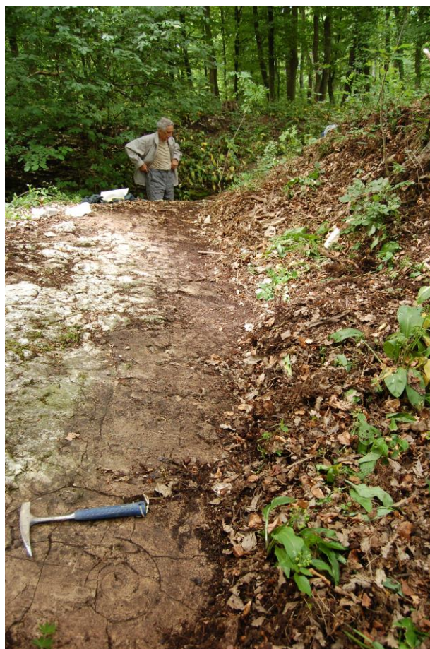
The outcrop of Hárskút, Bakony Mts, famous for its Cretaceous ammonites