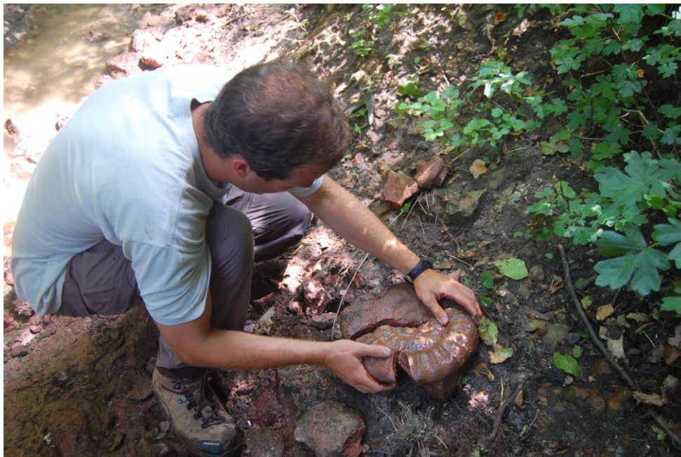
Fixing the pieces of a Jurassic ammonite