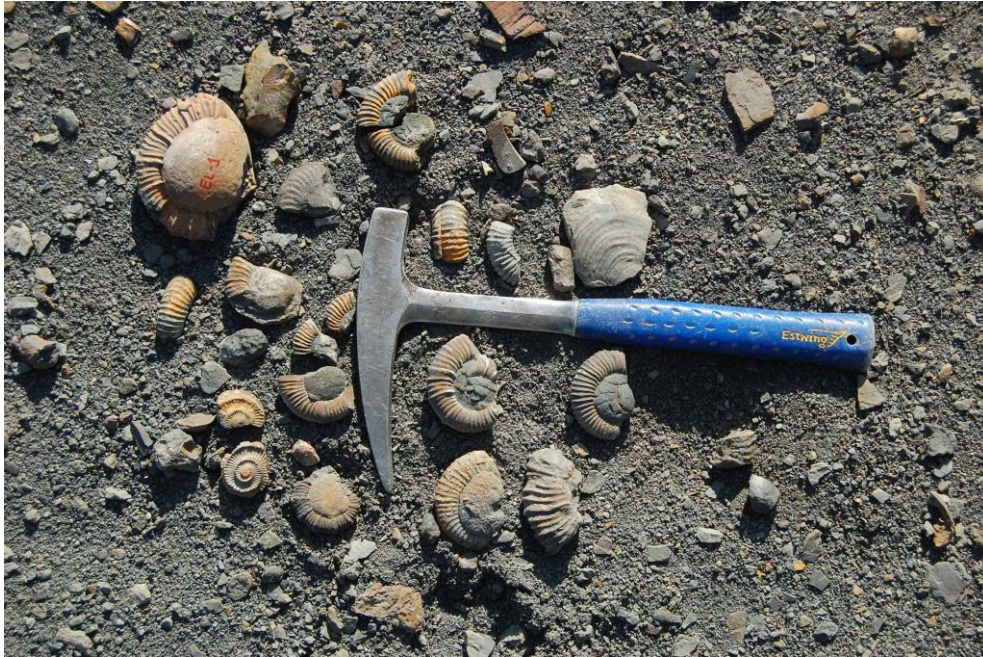
Ammonites just from the field (Chile, Aysén region)

An essential field of the Hungarian palaeontology is the ammonite research, that is based on fossils collected mostly from the Dunántúl Mountains and the Mecsek-Villány region. Besides Hungarian materials, e Mexican, Cuban, Argentinean and Chilean ammonite fossils are also investigated in the museum