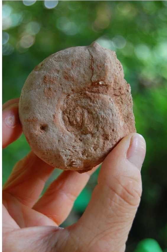
Jurassic ammonite ( Haploceras ) from Lókút, Bakony Mts