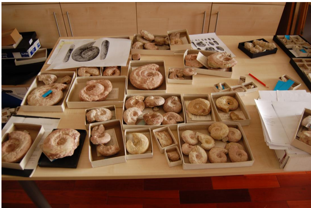
Cleaned ammonite specimens in the museum