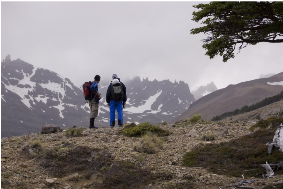
Fossil hunting in the Andes (Chile, Aysén region)