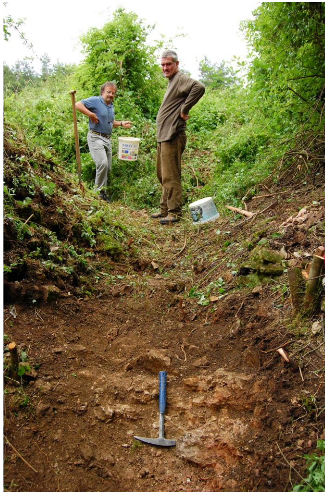
Artificial trench in the Bakony Mts