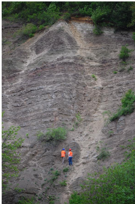
Searching for Cretaceous ammonites at Bersek Hill (Gerecse Mts)