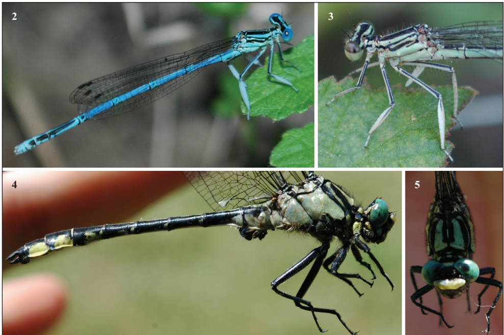
Figs 2–5. 2 = Platycnemis pennipes nitidula (Brullé, 1832) male from the Drin River at Balldren; 3 = same, female; 4–5 = Gomphus schneiderii (Sélys-Longchamps, 1850) male from the Shkodër Lake at Bajzë

Platycnemis pennipes nitidula (Brullé, 1832) – Montenegro , Bar municipality, Virpazar, Skadar Lake at the port, N42°14.793', E19°05.524', 10 m, 16.06.2012, FZ-KaT-KT-MD-PV, 1 L (HNHM: 2012/18) – Ulcinj municipality, Fraskanjel, Bojana River, N41°58'07.6'', E19°23'03.7'', 10 m, 27.05.2009, KT-MG-UL, 3 L (MM: 2009-56). Albania , Tropojë district, Pac, Pac Stream in the village, N42°17.846', E20°12.434', 555 m, 03.06.2009, BZ-LG-PD-SD, 2 ♂, 1 ♀ (HNHM: 2009/533) – Malësi e Madhe district, Bajzë, Syri i Hurdan spring lakes near Shkodër Lake, N42°16.299', E19°23.941', 10 m, 17.06.2012, FZ-KT-MD, 1 L (MM: 2012-95) – Shkodër district, Omarë, spring fed lake and its outlet W of the village, N42°09.226', E19°27.827', 10 m, 17.06.2012, FZ-KT-MD, several ♂♂ and ♀♀ observed – Shkodër district, Vau i Dejës, brook in mixed macchia along the road to Koman, NE of the city, N42°01.013', E19°39.636', 115 m, 17.06.2012, FZ-KT-MD, 1 ♀ (HNHM: 2012/30) – Shkodër district, Shpatar, small lakes W of the village, N42°00.766', E19°34.656', 15 m, 17.06.2012, FZ-KT-MD, some ♂♂ and ♀♀ observed – Kukës district, Novoselë, open stream N of the village, N41°59.056', E20°34.113', 1220 m, 24.06.2007, DL-EZ-FZ-HA-MD, 3 ♀ (HNHM: 2007/107) – Dibër district, Lurë area, Fushë Lurë, stream at the lumber-yard,