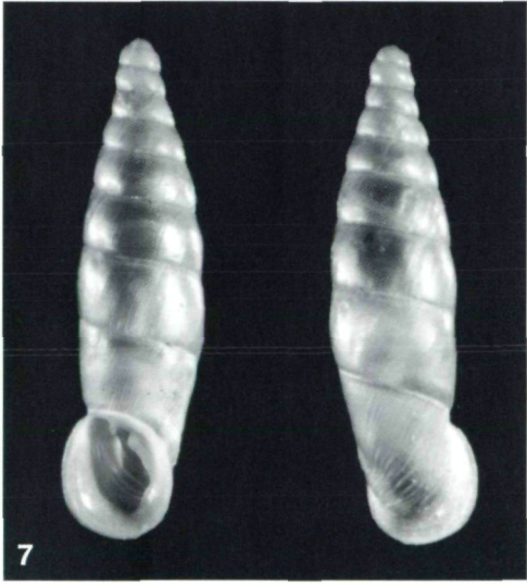
Figs 5-7: (5) Montenegrina helvola ornata Eröss & Szekeres ssp.n., holotype NHMB 70838, 15.7 × 3.3 mm; (6) Montenegrina irmengardis welterschultesi Fehér & Szekeres ssp.n., holotype NHMB 70840, 22.1 × 4.8 mm; (7) Isabellaria riedeli distanta Szekeres ssp.n., holotype NHMB 70842, 15.6 × 3.9 mm.

Description: The brownish horn-coloured shell of 9 to 91/_3 whorls is almost entirely smooth, with fine ribs appearing over the apex. The aperture is relatively large, rounded, the peristome is gradually widening. From behind the peristome to the dorsal region the neck is covered by coarse, evenly spaced ribs. The basal crest is well developed, it lends an angular contour to the last whorl when seen from the front. The lamella superior is short, slightly S-shaped. The lamella inferior is positioned high in the aperture, in a perpendicular view it stands well apart from the lamella superior and the mostly hidden subcolumellaris. The lunella is lateral to ventrolateral. The dimensions of the shells are 15.5-16.3 \times 3.7-3.9 mm.