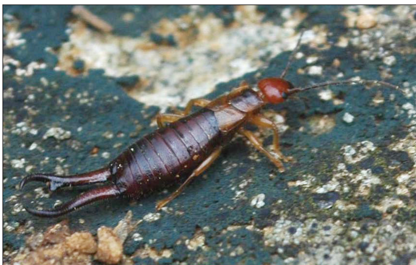
Fig. 2. Macrolabic male of Guanchia obtusangula (Krauss, 1904), Pelister Mts, Macedonia

Forficula auricularia Linnaeus, 1758 – Albania , Sarandë district, Borsh, plane trees and streamshore bush along Ixuur Spring and its outlet stream in the village, N40°03.686', E19°51.462', 105 m, 12.10.2013 (/34), PJ-TK-DM-GP: 2♂; Sarandë district, Shkallë, shore vegetation of Pavillë River NW of the village, N39°41.607', E20°06.992', 20 m, 12.10.2013 (/38), PJ-TK-DM-GP: 1♂; Delvinë district, Gjerë Mts, Bistricë, karst forest at a spring E of the village, N39°55.125', E20°08.799', 105 m, 13.10.2013 (/41), PJ-TK-DM-GP: 1♀; Gjirokastër district, Tsamantas Mts, Sotirë, streamside plane tree gallery in the village, N39°49.150', E20°21.612', 500 m, 13.10.2013 (/44), PJ-TK-DM-GP: 1♂; Kolonjë district, Grammos Mts, Rehovë, forest edge E of the village, N40°20.111', E20°43.467', 1445 m, 15.10.2013 (/58), PJ-TK-DM-GP: 1♀. – Macedonia , Polog region, Šar Planina, Vešala (Veshallë), streamside bush at the village, N42°03.865', E20°50.866', 1290 m, 01.10.2013 (/2), TK-DM: 1♂; Polog region, Šar Planina, Bozovce, woody pasture W (above) of the village, N42°03.125', E20°49.377', 1350 m, 01.10.2013 (/3), TK-DM: 1♂1♀.